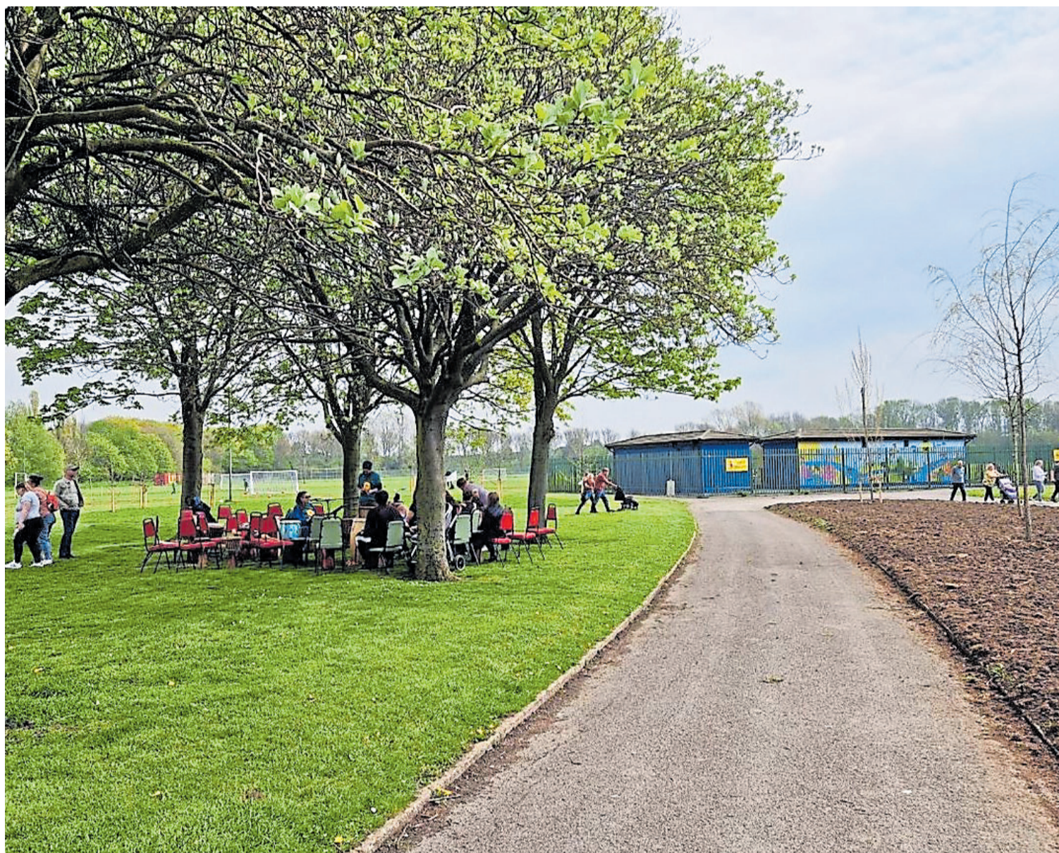
WINNING PROJECT: Young people who use Alderman Kneeshaw Park are being given a say on what they want to see there

There will be more projects in the next round of the fund. I will report on that in a future article.